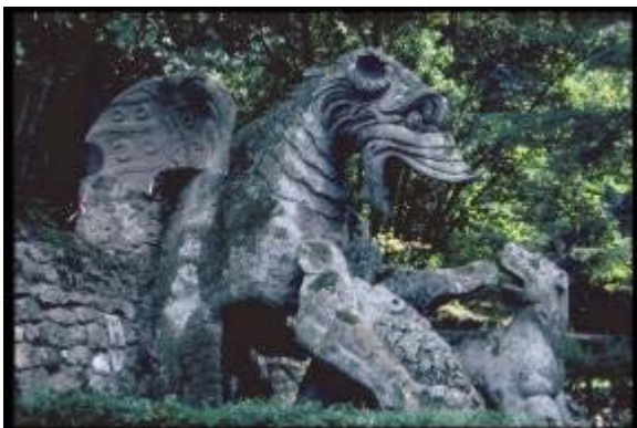
The park of Monsters

Following the departure of the popes in 1281, the town experienced a troubled period of wars that ended when it was annexed to the Pontifical State. The stability thus acquired allowed Viterbo to flourish once more.